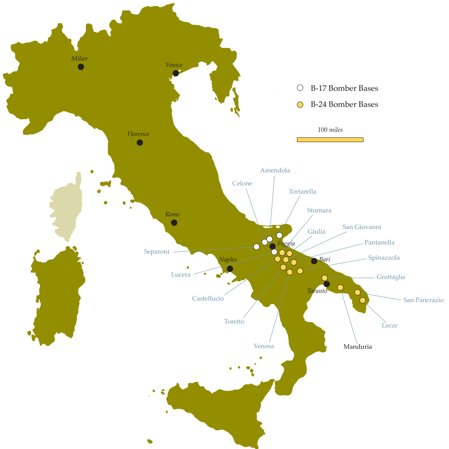
Map of Italy from 1944

We left Positano at 7:00 a.m. and drove east along the Amalfi coast, stopping briefly for breakfast in Salerno. From there we covered the same ancient route many of the US replacements had taken sixty years earlier as they were transported from the seaport of Naples to the air base in Manduria, only we were cruising along at a brisk 85 miles per hour much of the way. At 12:30 p.m. we were standing in front of the MUNICIPO, Manduria's City Hall, as we sought directions to the old air base.